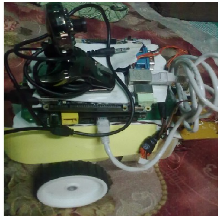
Figure: experimental set-up implementation.

The designed embedded remote control vehicle. After platform construction is completed, we integrated test the whole system through a simple gesture recognition experiments. Figure 8 shows the interface of the system console. Due to the obstacle refraction will affect the wireless signal strength the wireless communication distance is approximate 13 meters indoor and about 180 meters outdoor in open area. Video frame rate is 8.62fps-13.16fps (as the wireless signal status). The average recognition time of gesture recognition is 1.52 seconds, the system real-time within an acceptable range.