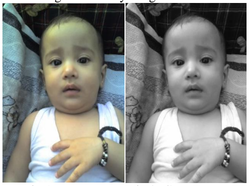
Fig 1. Input Image Fig 2. Grey Image

We applied both the above mentioned algorithms to different form of images, that is to clipart images, photographs (color images), grey scale images and noisy images