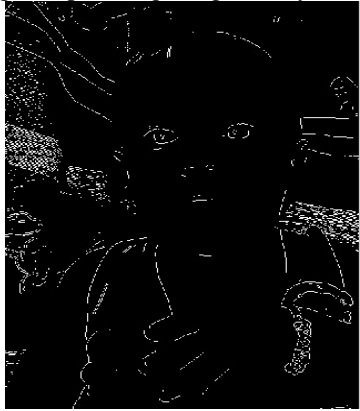
Fig 3.Resut of Sobel