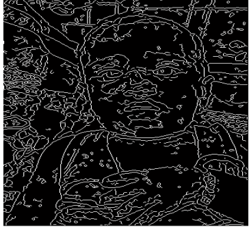
Fig 8. Result of Canny