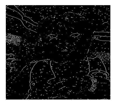
Fig 7. Result of Sobel