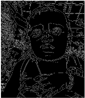
Fig 4. Result of Canny

From the above pictorial descriptions it is clear that Canny works better than the Sobel. Moreover it is clear that the Canny edge detecting algorithm is more precise because the edges that were not shown by Sobelare easily detected by Canny detector. The only disadvantage of Canny is that it takes more time as compared to Sobel.