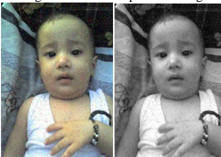
Fig 5.Noisy Image Fig 6. Gray Image

We added salt and pepper noise to the image and when it is passed through the detectors, the results are