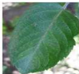
Fig-1(e) Texture Analysis