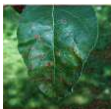
Fig-2(e) Texture Analysis