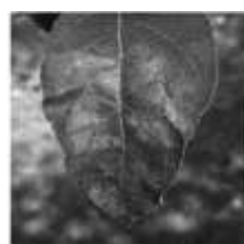
Fig-2(b) Gray Equivalent