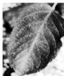
Fig-1(d) Histogram Equalized Image