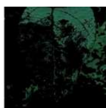
Fig-2(f) Color Analysis

By comparing the texture and color analysis images with the previous ones, few spots on the images can be seen which can be used for the further detection of plant diseases.