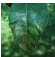
Fig-2(a) Affected Leaf

The above results show the effect after applying the algorithms in a normal leaf without any effect of disease. When a leaf is affected by any disease or it shows any symptoms then after the implementation of the CCM and K- means clustering algorithms the following results are obtained shown by figure 2(a)-(f). Fig-2(a) shows an affected leaf or a diseased leaf followed by the rgb2gray equivalent as shown in fig-2(b). The histogram of the affected leaf is shown in fig-2(c) and further the histogram equalization is done in fig-2(d). Color and texture analysis of the diseased leaf is shown in fig-2(e) and 2(f).