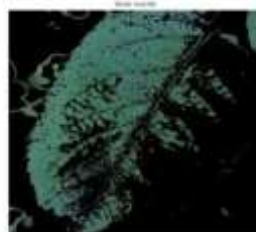
Fig-1(f) Color Analysis

The above results show the effect after applying the algorithms in a normal leaf without any effect of disease. When a leaf is affected by any disease or it shows any symptoms then after the implementation of the CCM and K- means clustering algorithms the following results are obtained shown by figure 2(a)-(f). Fig-2(a) shows an affected leaf or a diseased leaf followed by the rgb2gray equivalent as shown in fig-2(b). The histogram of the affected leaf is shown in fig-2(c) and further the histogram equalization is done in fig-2(d). Color and texture analysis of the diseased leaf is shown in fig-2(e) and 2(f).