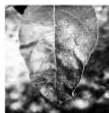
Fig-2(d) Histogram Eq.