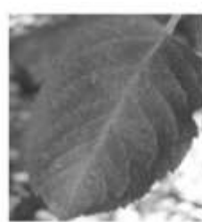
Fig-1(b) Gray equivalent