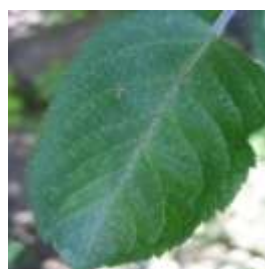
Fig-1(a) Original Image

In this paper fig-1(a) shows the original image which is followed by its rgb2gray equivalent in fig-1(b). The histogram of the original image is shown in fig-1(c) and fig-1(d) shows the histogram equalized image which is been done for contrast improvement. The texture, color analysis is given in fig-1(e) and fig-1(f) are obtained on Malus Domestica leaves after implementing the above algorithms.