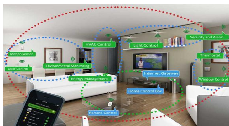
Fig.2. Smart Home Appliances

The middleware is a system that allows easy communication between things and humans via a number of protocols (or communication channels) such as email, Extensible Messaging and Presence Protocol (XMPP), Hyper Text Transfer Protocol (HTTP), Facebook, Jabber (Instant messaging), MXit, Radio Frequency Identification (RFID) tags, Quick response (QR) codes, Short Messaging Service, Multimedia Messaging Service (MMS) and Twitter. The main component of the middleware is the controller. The middleware is the interface between business services and the channels. These Businesses are services can range from a calculator, to a tweet back on dam levels or the temperature of an object, to the determination of a plant's moisture levels, etc. Requests for services in middleware come from the user via any of the above-mentioned channels. They are routed via the controller to the business services.