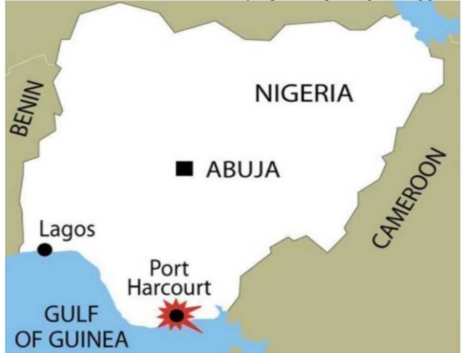
Fig. 1: Map of Port Harcourt

The Port Harcourt International Airport, for instance, relies 100 per cent on generators for the running of the airport and uses about 132,000 litres of diesel monthly to power its private generating plants [7].