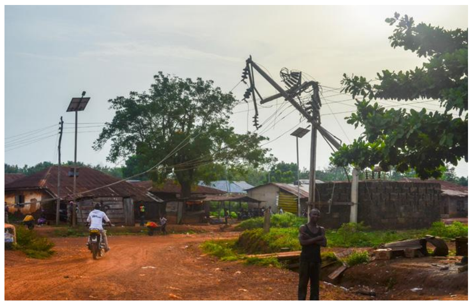
Fig. 3: Broken infrastructure potential cause of power outage.