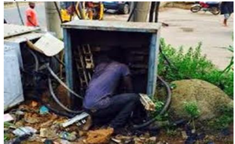
Fig. 4: A Vandal electrocuted in a distribution transformer