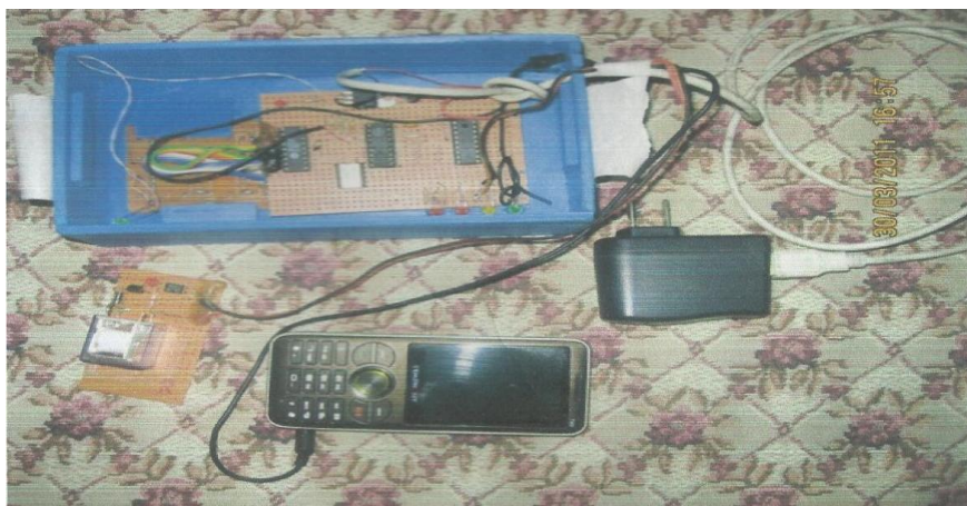
Fig 3. shows the practical implementation of the circuit.