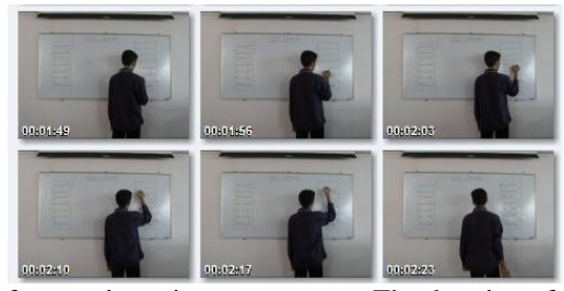
Fig. 4.1 : Selected frames from an input image sequence. The duration of the sequence is 34 second single frame that is completely unoccluded. A few sample image frames are shown in Fig. 4.1. We need to deal with these problems in order to extract the new pen strokes.

The input to RTWCS is a sequence of video images as shown in Fig. 4.1. We need to analyze the image sequence in order to separate the whiteboard background from the person in the foreground and to extract the new pen strokes as they appear on the whiteboard. However, our system has a set of unique technical challenges. The whiteboard background colour cannot be pre-calibrated (e.g., take a picture of a blank whiteboard) because each indoor room has several light settings that may vary from session to session and outdoor room lighting condition is influenced by the weather and the direction of the sun. Frequently, people move between the camera and the whiteboard, and these foreground objects occlude some portion of the whiteboard and cast shadow on it. Within a sequence, there may be no