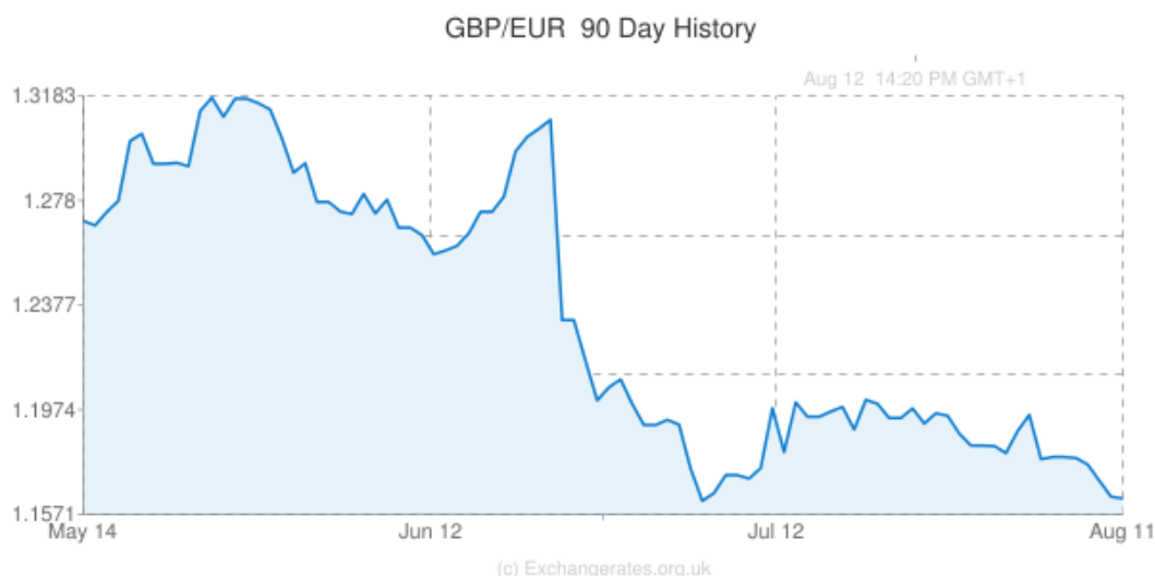
Figure 3. The pound depreciates under the impact of Brexit (Sydorova & Yakubovskiy, 2018)

Another effect could be seen as soon as the UK left the EU, British government bonds would be negatively affected by the instability of the UK economy, leading to increased borrowing costs. Some credit rating agencies believe that this may cause them to reevaluate the status of UK government bonds, and may even have to reduce the credit rating for this type of bond. This is the inevitable consequence of the UK government's borrowing costs will increase.