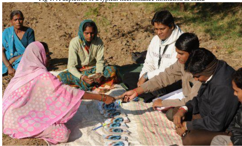
Fig 1: A depiction of a typical microfinance institution in India