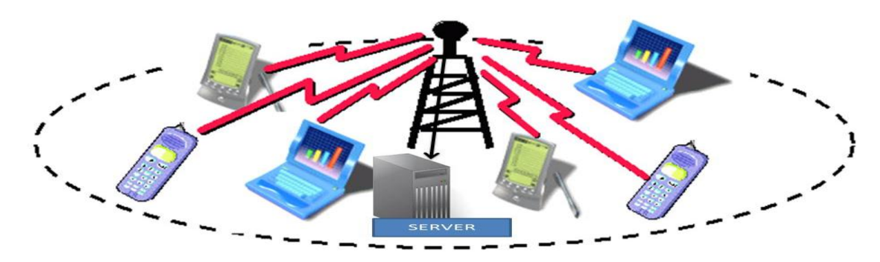
Figure 1: Layout of Architecture