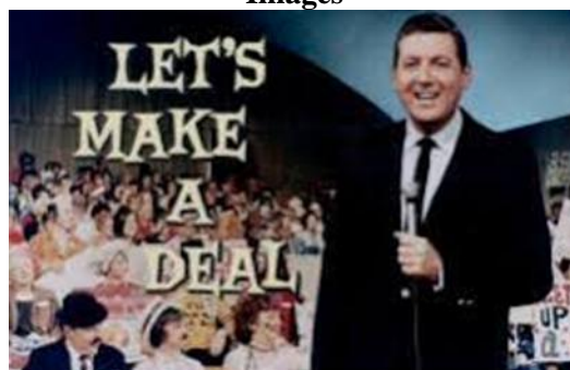
Figure 1: Who I believe was the original Monty Hall and I believe that to be my uncle.