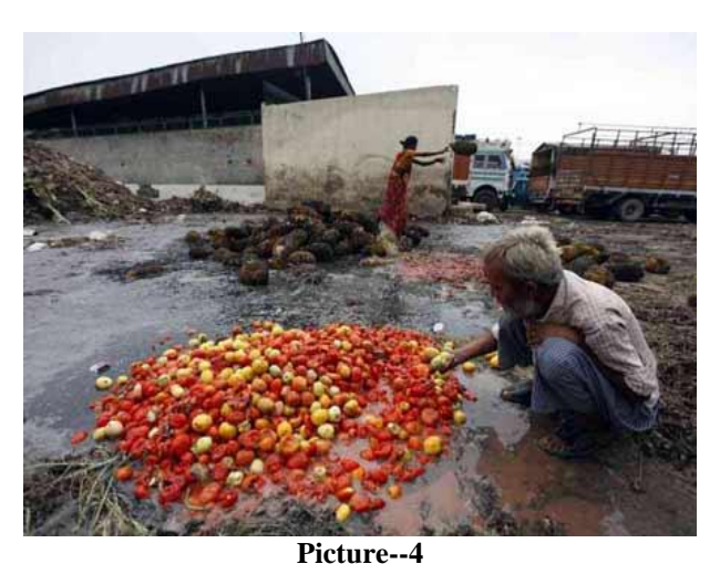
April 2013 saw farmers in West Bengal, India, venting their anger and

frustration by throwing The revelation exposes how government is struggling on two counts – safe storage of foodgrains and inadequate storage facilities for food items. Their year's yield of tomatoes on the roads. Having spent nearly 8 rupees ($0.15) for producing one kg of tomato and failing to get even 1 rupee ($0.02) in the market, most farmers resort to selling their produce at a loss. Ironically, while farmers are incurring huge losses, end consumers are shelling out 12-15 rupees for a kg of tomatoes. (Story in Business Line)