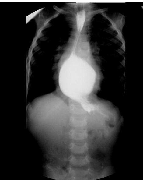
Fig 2: Barium swallow showing dilated esophagus with mild narrowing at the gastroesophageal junction with reflux of contrast from the fundus of the stomach into the esophagus

After 8 months, he came back with complaints of not taking anything orally and his nutritional status continued to be poor. He was therefore admitted to improve his nutritional status and for further evaluation. On assessment, child was pale and undernourished. Upper Gastrointestinal (GI) scopy showed dilated esophagus with nodularity, coated with whitish plaque suggestive of fungal esophagitis and small blind stomach. Gastrografin swallow study showed dilated esophagus (Fig 3). The rest of the stomach distally and duodenum was not opacified. Therefore the child underwent Hunt Lawrence J pouch, where the feeding jejunostomy was taken down and J pouch was made from jejunum and Roux-en-Y anastomosis was done. Nasojejunal (NJ) tube was placed beyond the anastomosis. Small NJ feeds was initiated on the 3<sup>rd</sup> postoperative (POP) day, oral liquids on the 8<sup>th</sup> POP day and the child was taking normal diet by the 13<sup>th</sup> POP day. At discharge he was recommended Vitamin B12, Folic acid and multivitamin supplements.