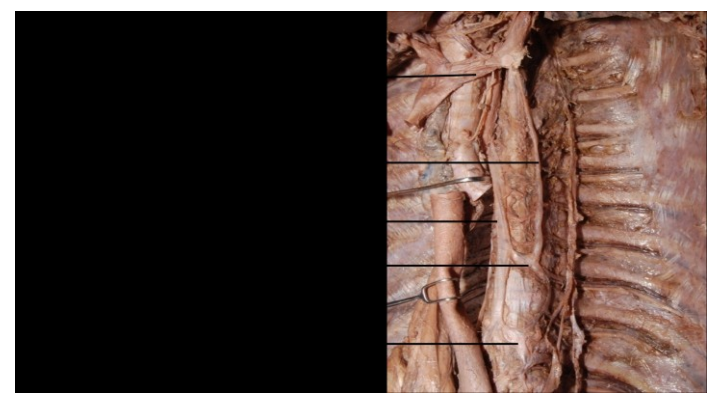
Fig 2: Hemiazygos vein and accessory hemiazygos vein forms common channel and drains into left brachiocephalic vein above and azygos vein below.

Variation: 1 In this specimen, 2<sup>nd</sup> to 11<sup>th</sup> Left posterior intercostal veins drained into single trunk (hemiazygos vein and accessory hemiazygos vein). This trunk terminated superiorly into left brachiocephalic vein and inferiorly joined the azygos vein at the level of 9<sup>th</sup> thoracic vertebra. Prior to its termination into azygos vein this venous trunk received 9<sup>th</sup>, 10<sup>th</sup> and a twig from 8<sup>th</sup> left posterior intercostal veins. The 11<sup>th</sup>, 12<sup>th</sup> and a twig from 10<sup>th</sup> posterior intercostal vein at T11 vertebral level (Fig2).