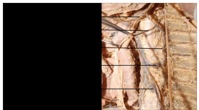
Fig 4: Accessory hemiazygos vein receives pericardiophrenic vein and drains into left brachiocephalic vein above and azygos vein below.

Varaition: 3 Type 3^{rd} configuration was similar to that described in type-1 configuration. A single venous trunk after receiving 2^{nd} to 11^{th} left posterior intercostal veins, drained by two routes into left brachiocephalic vein superiorly and azygos vein inferiorly at the level of T7 vertebra. The common channel before it terminated into left brachiocephalic vein also received pericardiophrenic vein. Hemiazygos vein followed the normal pattern of drainage after receiving 9^{th} to 11^{th} left posterior intercostal veins (Fig4).