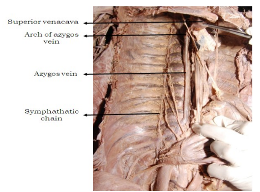
Fig 1: Azygos vein draining into superior vena cava

Variations of azygos system of veins are usually associated with other congenital anomalies, especially cardiac anomalies. According to recent data, the incidence of this variation is 0.6 - 2.0% in individuals with congenital cardiac malformations and less than 0.3% in individuals without any variations or anomalies ( Trubac et al, 2002 ). Presence of this vascular variation without any other anomalies causes no clinically evident problems. Such variations are found only during radiological examination or surgical procedures of posterior mediastinum. This variation can cause venous insufficiency of lower limbs with a potential thromboembolic disease. These venous anomalies may be mistaken for mediastinal mass or lymphadenopathy.