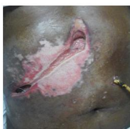
Figure – 8

Complex wounds may occasionally have areas that require different care. This technique can be used to isolate one area of the wound that requires drainage containment from other areas that may require packing or dressing changes. Solid wafer skin barriers cut into small pieces and placed at the bridge location to help facilitate pouch placement. (Figures -8, 9 & 10)