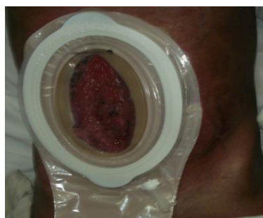
Figure – 5

Care must be taken to size the orifice in the adhesive surface appropriately so as to ensure accommodation of the fistula with minimum exposure of the peristomal skin to the effluent (Fig – 5)