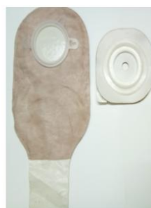
Figures – 4 Two- piece stoma appliance

Care must be taken to size the orifice in the adhesive surface appropriately so as to ensure accommodation of the fistula with minimum exposure of the peristomal skin to the effluent (Fig – 5)