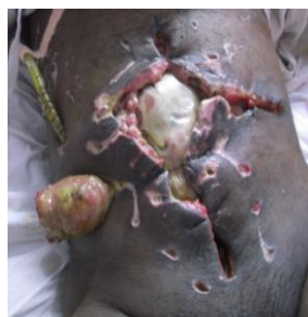
Figure – 12 Complex wound

use (open pore structure 400–600 microns) that allow for exudate removal and promote granulation formation. In most cases where the V.A.C. dressing was used, it enabled earlier discharge from the hospital and did enhance perifistular wound healing but did not lead to fistula closure. Modifications to this technique have shown great promise where the V.A.C. dressing is applied to the perifistular wound while skin barrier wafers are used to isolate the fistula itself [8].