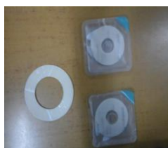
Figure -11 skin barrier molds

A complex pouch technique that can be used when the fistula orifice is recessed in an open wound or surrounded by numerous irregular skin surfaces. The mold fills (Fig – 11) the wound and creates a flat surface for pouch adherence.