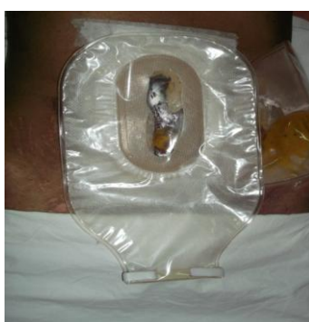
Figure – 3 fecal outlet pouches

Alternative pouch outlets include fecal outlets with a drainable clip (Fig – 3) that is appropriate for fistulas with 24-hour output less than 1000 mL and wide tubular outlets or wound managers