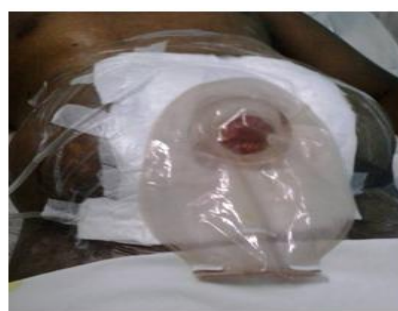
Figures – 7 Application of pouch over the transparent dressing