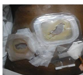
Figure – 10

Bridging with skin barrier paste and solid wafers