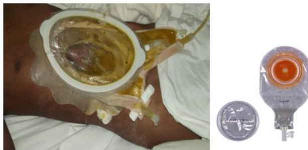
Figure – 2 Urinary outlet pouches

Alternative pouch outlets include fecal outlets with a drainable clip (Fig – 3) that is appropriate for fistulas with 24-hour output less than 1000 mL and wide tubular outlets or wound managers