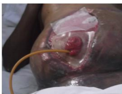
Figure – 6 Fistula that is recessed within a wound

This is useful if the fistula is recessed within a wound that makes routine pouch application fail. The wound is covered with a transparent dressing (Fig – 6) in which a hole is cut in the most dependent portion of the wound over which a pouch is applied (Fig – 7). To enhance adhesion of the transparent dressing and maximize skin protection from effluent, strips of barrier wafer can be cut and applied to the wound edge prior to application of the transparent dressing.