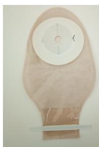
Figure – 4 One piece stoma appliance

One piece pouches (Fig- 4) are preferable as they lack an attachment ring and are therefore more pliable for application to irregular skin surfaces. Two-piece pouches (Fig – 5) allow for access to the fistula without removing the entire pouch.