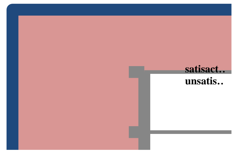
Figure (2): Distribution of total self care strategies pre, and post program implementation (n=100).

Table (3) Relation between patients' socio-demographic data and total knowledge score pre and post program implementation (n=100).