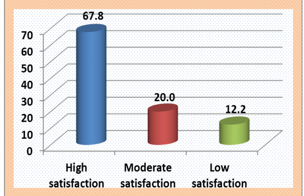
Figure (3): Total job satisfaction level of the studied staff nurses`

Table (5) : Indicates that the highest mean score of staff nurses' job satisfaction was related to work environment (25.01\pm8.64) , while the lowest mean score was related to safety at work (7.23\pm4.15) .