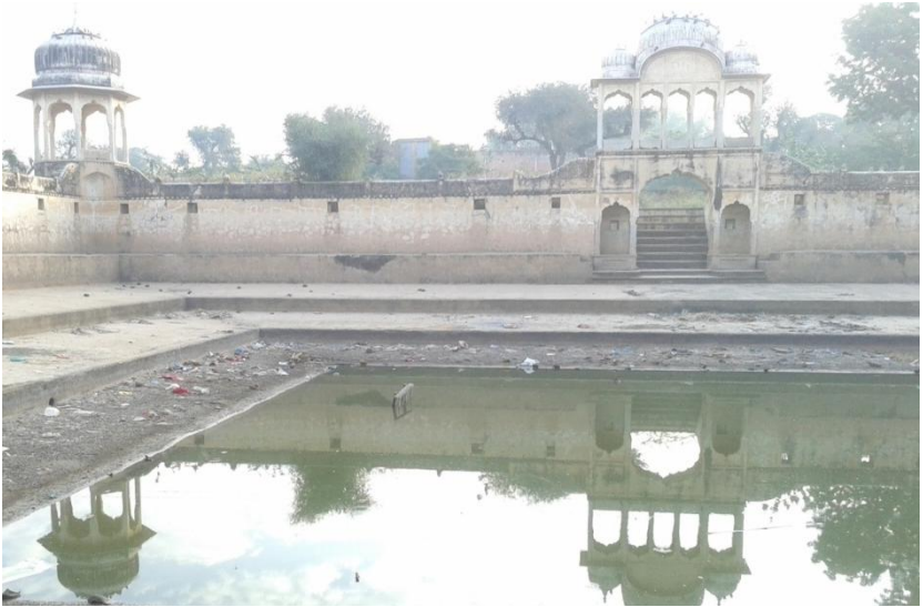
Fig. 2: Fateh Sagar Talab in Bagar, district Jhunjhunu in Rajasthan