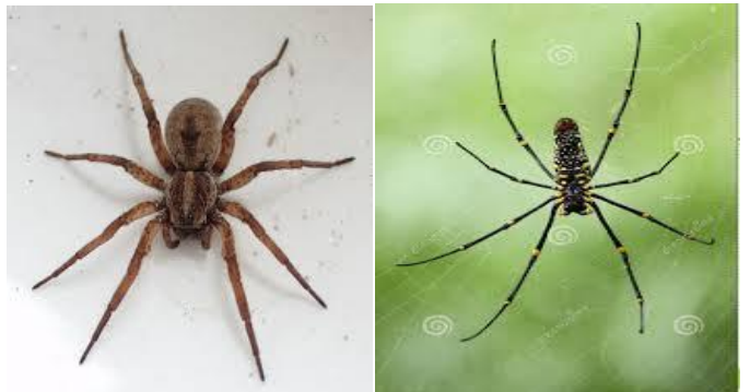
Haplodrassussp (F.Gnaphosidae)Argiope (F.Areanedae)