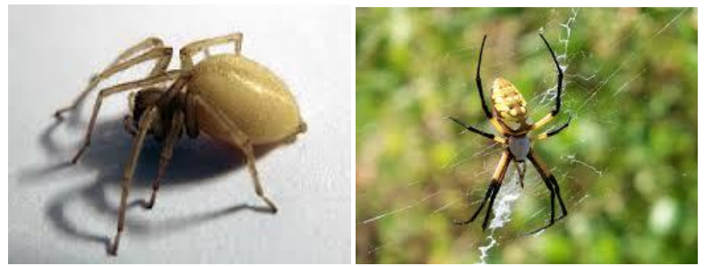
Cheiracanthiumsp (F.Miturgidae)Argiope (F.Areanedae)