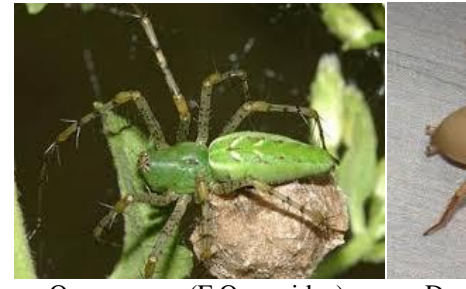
Oxyopus sp. (F.Oxyopidae)