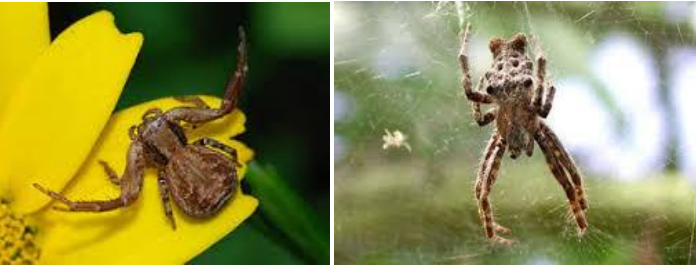
Xysticus sp (F.Thomisidae)