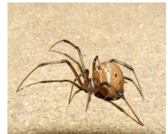
Achaearanea sp (F. Theridiidae)