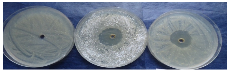
Figure 2: Petri dishes for antimicrobial activities against Salmonella typhi , Geotrichum candidum and Candida albicans (From left to right)