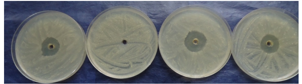
Figure 1: Petri dishes for antimicrobial activities against Staphylococcus aureus , Bacillus subtilis , Escherichia coli and Klebsiella pneumoniae (From left to right)