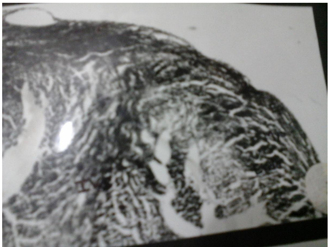
Image 3 Magnified view of cardiac layers of right ventricle with septum as seen in figure showing disrupted myocardial fiber.

Pc-Pericardium, Epi- Epicardium, Myo- Myocardium, Endo- Endocardium, IVS- Intraventricular septum, Pf-Purkinje fibre, tab-Trabanculae, CA-Coronary artery, BV-blood vessel, RV-Right ventricle, LV-Left ventricle.