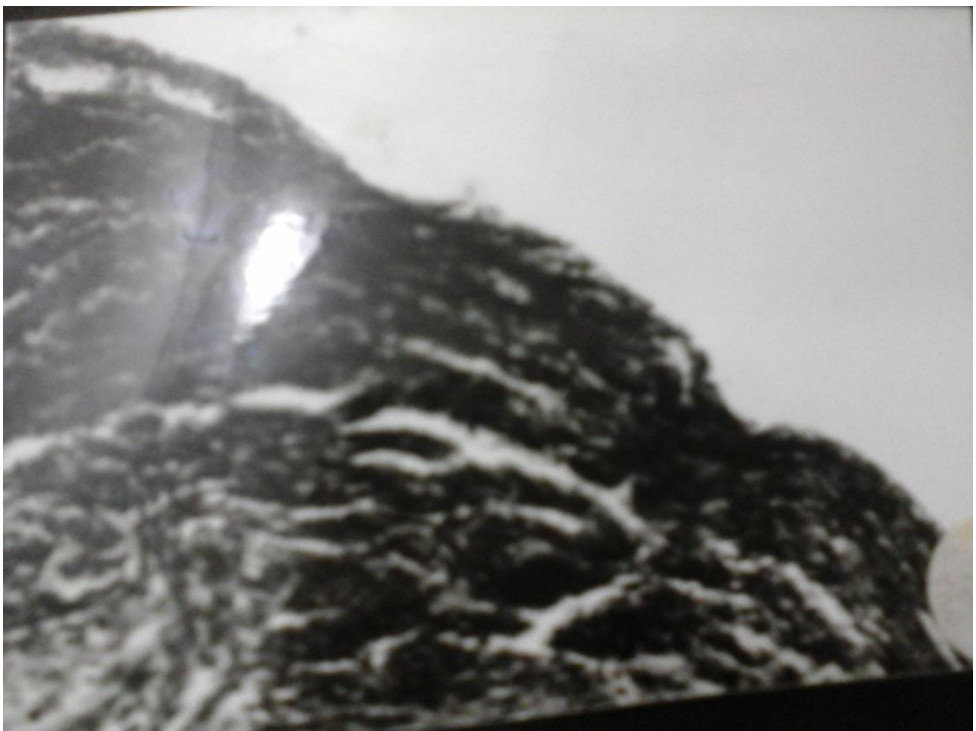
Image 2 Magnified view of layers of right ventriclesas seen in figure.

Pc-Pericardium, Epi- Epicardium, Myo- Myocardium, Endo- Endocardium, IVS- Intraventricular septum, Pf-Purkinje fibre, tab-Trabanculae, CA-Coronary artery, BV-blood vessel, RV-Right ventricle, LV-Left ventricle.