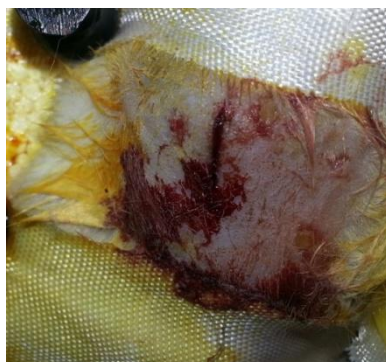
Figure (4-b): Wound case directly after exposure for 3 minutes.