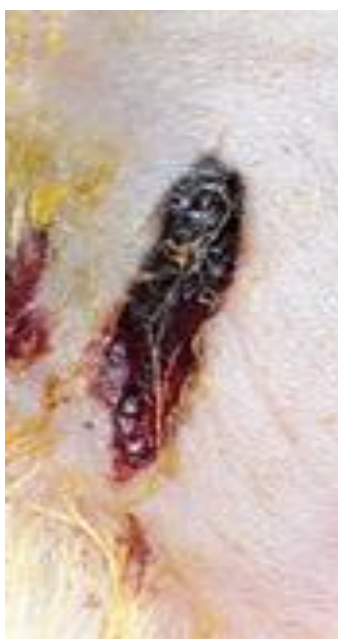
Figure (5-e): Wound after 1 day after exposure for 6 minutes.