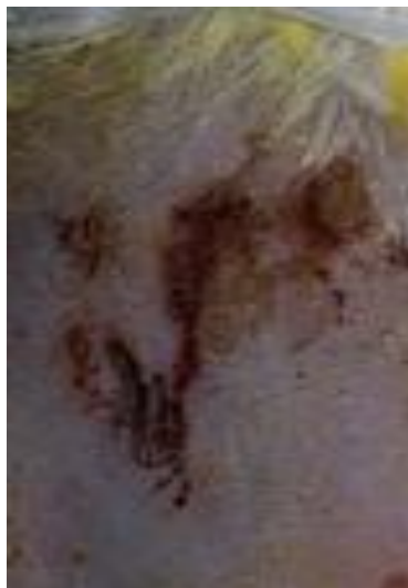
Figure (4-e): Wound case directly after exposure for 12 minutes.