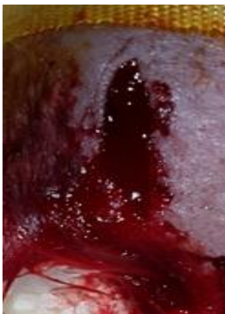
Figure (5-b): Wound directly after exposure for 3 minutes.