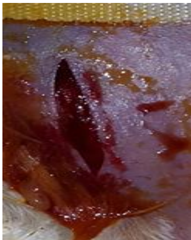
Figure (5-a): Wound after exposure (mice were injected Glucose solution).