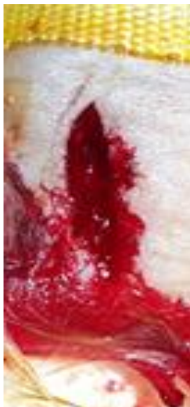
Figure (5-d): Wound after 15 minutes after exposure for 6 minutes.