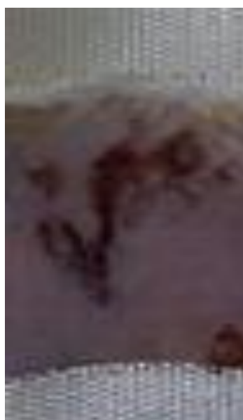
Figure (4-f): Wound case directly after exposure for 15 minutes.

from the current results of this experiment in which the time of exposure was increased and was given in different sessions separated by regular intervals indicated that it is possible to increase the time of exposure by dividing the total time of exposure to short and separated sessions, and this would help to accelerate the healing of wounds, and did not cause any noticed side effects as a result of increased exposure.