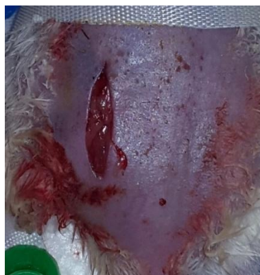
Figure (2): Wounded mice before exposure to the cold plasma.

a group of normal mice represents control group, each mouse was shaved in the area where the wound will be. A scalpel was used to make a wound of 1 cm long in the rear area of the dorsal of each mouse as can be seen in Figure (2). One of the wounded mice was left without exposure to the cold plasma to serve as control to observe the time of the wound case and the recovery time. It was found that the control mouse has died after 24 hours due the bleeding. It was observed that most of the control mice die after different periods of time because the bleeding from the wound.