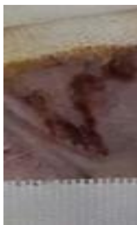
Figure (4-d): Wound case directly after exposure for 9 minutes.