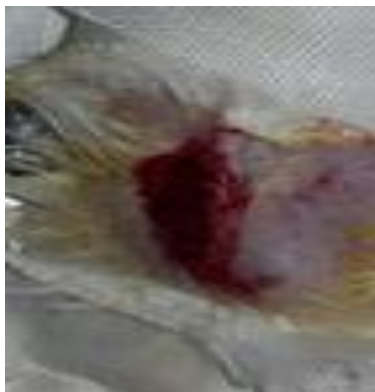
Figure (4-a): Wound case before exposure.