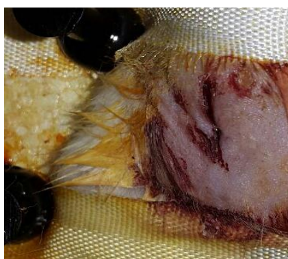
Figure (4-c): Wound case directly after exposure for 6 minutes.