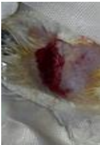
Figure (3-a): Wounded mice directly after exposure for 5 minutes.