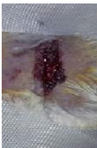
Figure (3-c): Wounded mice after 15 minutes when exposure for 5 minutes.