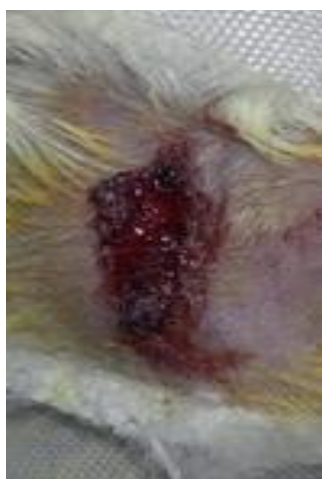
Figure (3-b): Wounded mice after 12 minutes when exposure for 5 minutes.