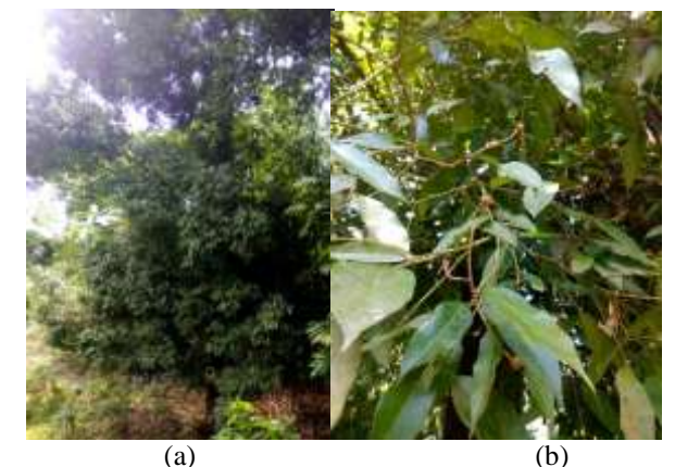
Fig. 1. (a) The plant K. assamica and (b) Leaf of K. assamica .