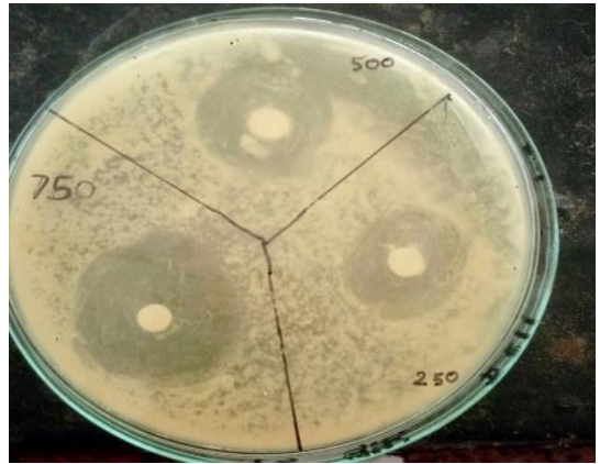
Fig: Gomutra on the Staphylococcus aurous Bacteria

The compound were for their in- vitro evaluation of antimicrobial activity was carried out by using disc diffusion method. The antimicrobial activity of was used as a standard drug and response of microorganisms to the synthesized compounds has been measured with that of the standard drug ciprofloxacin and microorganisms were selected for the study was Escherichia coli (Gram –ve), stapyloccocus aureous (+ve). Were procured from Microbes Specialty Lab. The medium was suspended in 100ml of purified water. The mixture was allowed to boil till it forms a homogeneous solution. The medium was autoclaved at 121°C for 15minutes at 15psi. Media was cooled to the temperature of approximately 40°C temperature and microorganisms were inoculated to the media. 150ml was transfer to a Petri plates aseptically. Two such plates were prepared for each organism. Plates were allowed to cool for 20 minutes. Compounds were dissolved in DMSO and diluted in same to get concentration of 250μg/ml, 500μg/ml and 750μg/ml. Here both high and low strength disks were applied for each compound to be tested. The organism was reported as being sensitive if clear zone appears around both disks. Ciprofloxacin 100μg/ml was used as standard.