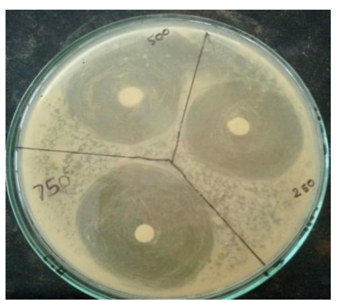
Fig: standard cefpodoxim on the Staphylococcus aurous Bacteria