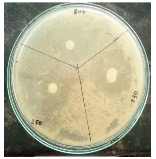
Fig .Gomutra on the E.coli bacteria