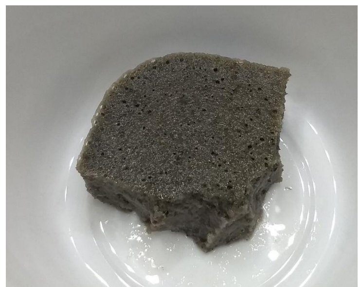
Figure 1. Compound of bullfrog skin and noni.

After sterilization, the solution was blended with 300 g ofnoni's pulpwithout seeds for about 5 minutes until obtain a smooth and homogeneous mixture. The compound was then refrigerated and stored at 2-8 °C, reaching a consistency similar to gelatin. Under this storage condition, the shelf life of the compound is about 30 days. Figure 1 shows a piece of this compound after refrigeration.