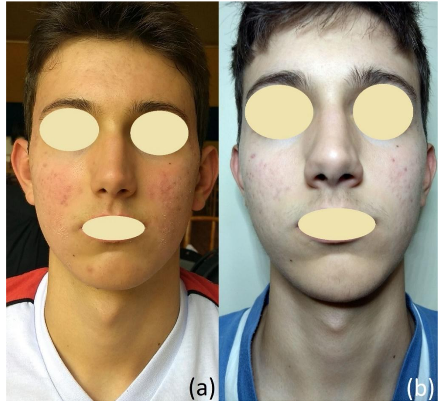
Figure 4.Patient's face throughout treatment: (a) after three months; (b) after four months.

Figures 3 and 4 show the patient's face throughout treatment. The picture in Figure 3a was taken at the August first, immediately before the start of treatment. The other photos correspond to the situation at the end of the first (Figure 3b), second (Figure 3c), third (Figure 4a) and fourth (Figure 4b) month of treatment, respectively.