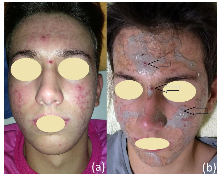
Figure 2. Patient's face (a) beforeand (b) after the compound application.

Figure 2 shows the patient's face before and after the compound application. Figure 2b shows three arrows pointing to the most inflamed acnes which received an extra amount of the compound to intensify the healing action.