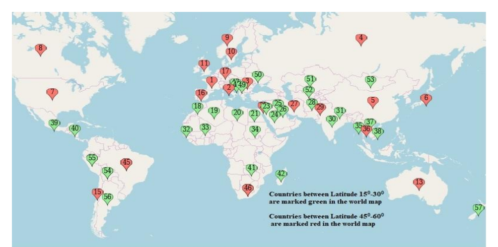
Figure1. Plotting of the infected countries (i) Red symbol indicates the number of infected people greater than 1000 as on 29<sup>th</sup> March 2020 (ii) Green symbol indicates the number of people less than 1000 as on 29<sup>th</sup> March 2020.