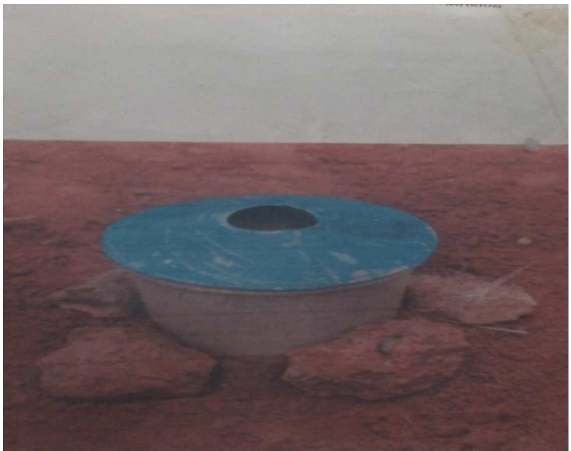
Figure 2: Modified Tauber-like Pollen trap in the field