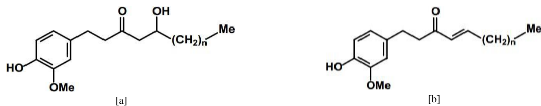
Figure 1: a. Gingerol chemical structure b. Chemical structure of shogaol 5 .

The chemical structure of gingerols and shogaols can be seen in Figure 1 below :