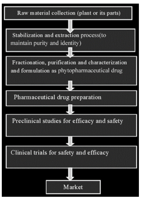
Figure 2: The process of development to end product of phytopharmaceuticalsxIviii