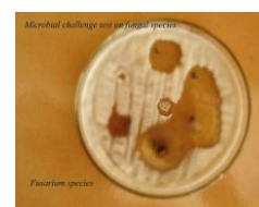
Fig: Fusarium species