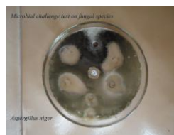
Fig: Aspergillus niger