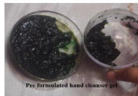
Fig: Formulated hand wash gel