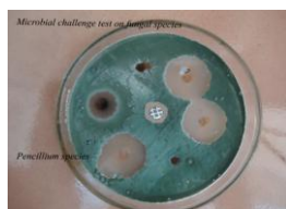
Fig: Penicillium species