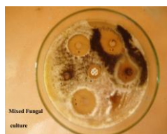
Fig: Mixed fungal species