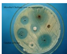
Fig: Candida albicans

Formulation- Gel base + Camellia sinensis (2% concentration)+ Myristica fragrans (2% conc.)