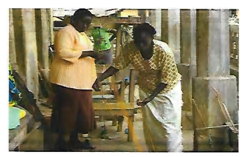
Fig 6: Draw in Warp Yarns on the Horizontal Loom

This is the process whereby the yarns are drawn or set on the loom to get ready for weaving (Fig 6). After setting it, upper and lower layers must be formed to give two separate sheds. It is inside this two separate sheds that the weft yarns would pass through in an alternate manner to create the fabric (Fig 7).