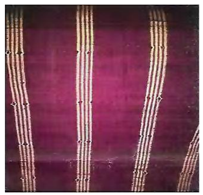
Fig 4-: Alarri Hand Woven Cloth, spun cotton, 79cm/62cm, 1954.

Alaari cloth (Fig 4) is crimson in colour. It is traditionally woven with, locally spun silk yarns dyed in red camwood solution to achieve permanence in colour fastness. The use of Alaari is not limited to a particular ceremony but traditionally used for all events among the Yoruba people.