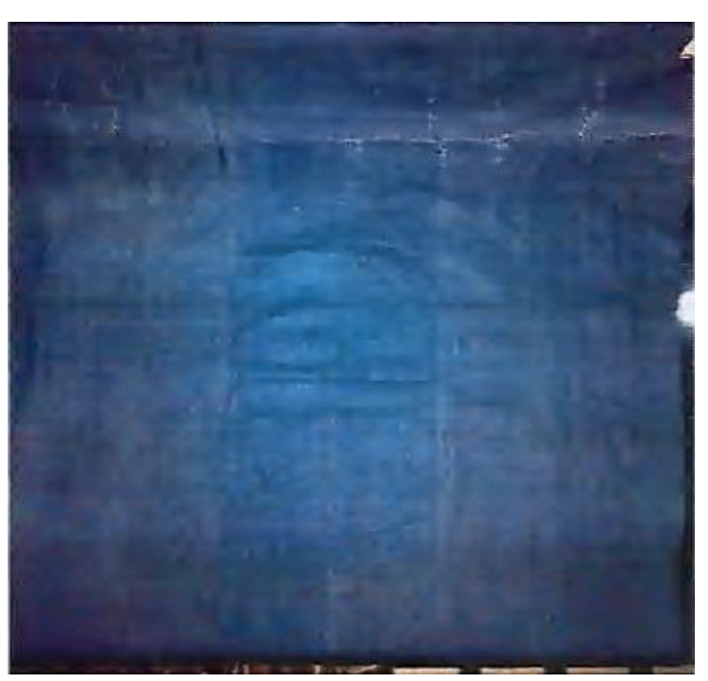
Fig 3-: Etu Hand Woven Cloth, spun cotton, 79cm/62cm, 1952.

and stretching. In ancient times, Etu is used as important social dress by chiefs, elders and traditional royal kings among the Yoruba. The second type of Etu is PETUJE: it is just like Etu" cloth but the colour is lighter when compared with the deep blue colour of "Etu" cloth.Etu was first woven before the introduction of Petuje, a lighter colour of Etu as may be requested by some people.