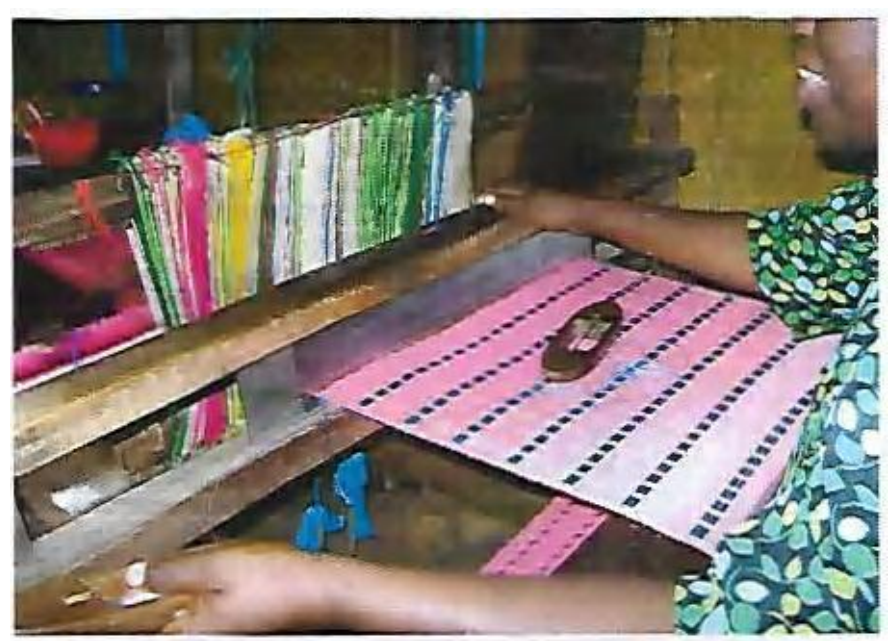
Fig 9:- Broad Loom.

To make hand woven cloths to compete more favourably with electronically driven woven machine, broad woven loom (Fig 9) is now adopted which can weave up to 26 inches wide fabric. Fewer strips of it are needed to make a complete outfit/attire, as against several strips made on the horizontal narrow loom.