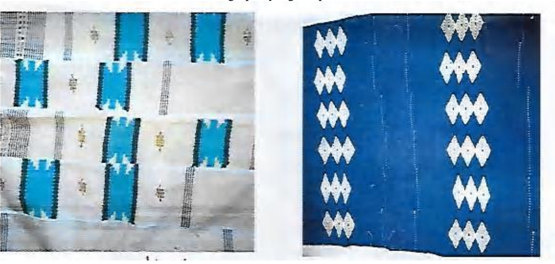
Fig 8: Some Samples of Contemporary Aso-oke on Display

Indication from the various sources of materials used in the production of indigenous woven cloth (Aso-oke) would suggest combined contribution of the services of artisans such as farmers-Cotton growers, cassava/gari producers as well as paint producers. [11]opines that, the concept of economy is that it embraces all aspect of human endeavour where resources optimization is involved. National economy can be placed within this concept as maximization of all aspect of national resources is in relation to human input on material resources. While the involvement in vocational and technical skill of weaving traditional cloth (Aso-oke) not only represents an economic develop for the nation but has also maximize the use of cotton, leaves and planks as all products of human capacities. [12], asserts that there are links between individual surviving options that will increase human capital development on one hand, and also create essential goods that will necessarily promote their well-being, harmony and growth of the society and nation on the other hand.