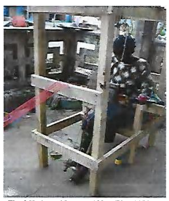
Fig. 2 Horizontal Loom: - 138cm/79cm/154cm,

The double heddle loom used by men is a horizontal loom with unwoven warp yarns stretched out several metres in front of the weaver with heavy stone or heavy metal to maintain tension. The loom produces strips of woven fabrics, which is about 14cm-15cm wide. The fabrics are cut and the selvages stitched together to make a larger piece of cloth which could be used for clothing or coverings.