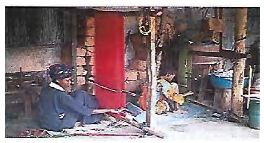
Fig. 1: Single Heddle Loom (Vertical)

two major types of Kijipa. The first one is of blue-black colour commonly used by women. The second type is of pure white or creamy white colour preferred by men. Kijipa is mainly used for manual work because it is very thick and does not tear easily. An average Yoruba man that wants to go to the farm or do any vigorous work would prefer to wear Kijipa to do the work, because the cloth is strong and durable.