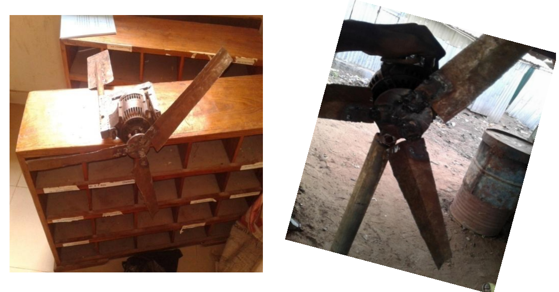
Figure 5: Coupled Alternator, Turbine, Frame and Galvanized Pole

Alternator connected to the blade with the tail was tighten with two 17 spanner size bolt & not of 10 mm tap tread, which hold tight the alternator connected to the blade with the tail together with the galvanized steel pipe stand.