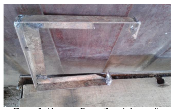
Figure. 3: Alternator Frame (3-angle bar steel)

The frame made up of 3-angle bar steel, which was cut in three different lengths (top breath 6.7 inch, base breath 6.2 inch and height 7.8 inch), was welded together joint to joint of the three joint firmly with gauge 12 electrode. This is shown in Figure 3. There was a need to use the square bar to check if the 3-angle bar is perfectly square. This will make the angles to be at 90° to one another, before securing a permanent welding.