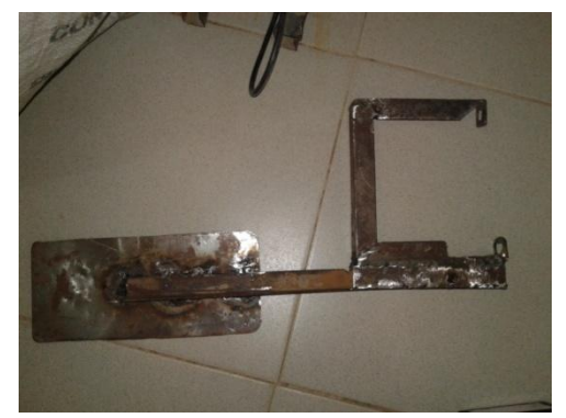
Figure 4: Tail (wind direction) welded with Frame

Steel plate of 0.5 mm thick was cut out with the use of grinding machine, cutting disc tighten to the grinder was use for cutting of the tale for this wind turbine and welded to steel of (3-angle bar) with length of 21 inch. The tail keeps the turbine facing the wind direction, as shown in figure 4. The small wind turbine cannot put motors with orientation of rotor facing the wind direction; almost all small wind turbines have directional arms to guide the rotor into the wind.