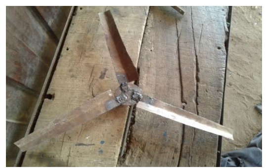
Figure 2: constructed Turbine (3-dimensional blade)