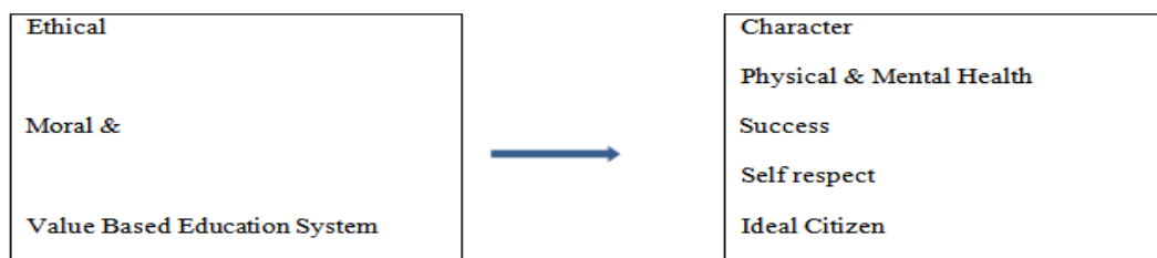
Figure 2 EMV based education system

Education gives a platform to succeed, but EMV based education gives the knowledge of social conduct, physical and mental strength, character and self-respect in addition to it. The greatest gift EMV based education gives us is the understanding of unconditional love, difference between right and wrong, self belief and faith in God, importance of hard work and self-respect. Therefore it is a continuous learning process from people, leaders and followers and then growing up to be the citizens we are meant to be.