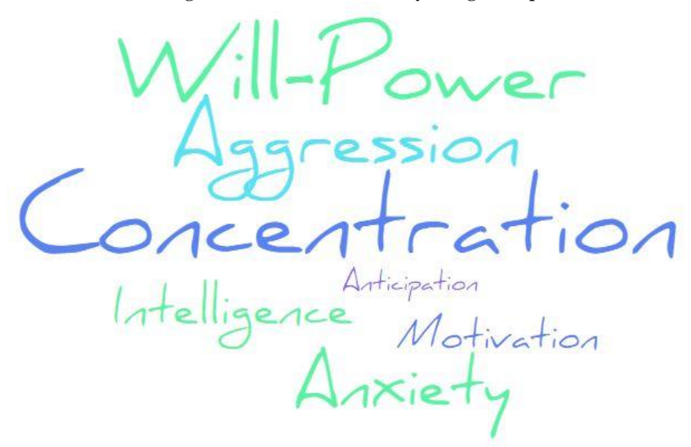
Figure No.4: Word Cloud of Psychological Aspects

There is a strong relationship between Concentration and Player Performance; therefore, the Null Hypothesis is accepted, and the Alternative Hypothesis is rejected.